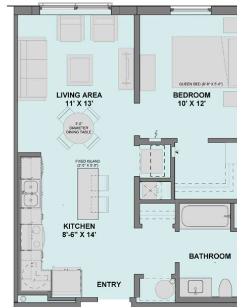
1 UNIT TYPE 1A - (1BR TYP.) 38' x 1'-0"