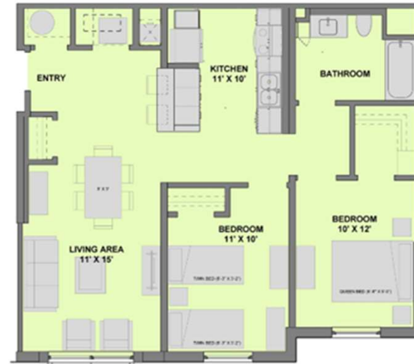
⑤ UNIT TYPE 2C 38' x 17'-0"