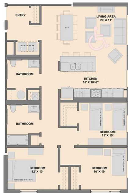
② UNIT TYPE 3A - (TYP. 3BR CORNER-GROUP 1) 38' x 14'