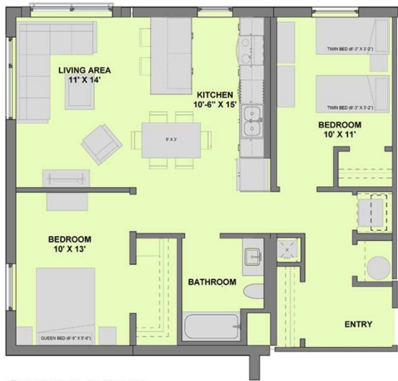
④ UNIT TYPE 2E - (2BR CORNER) 38' x 17'-0"