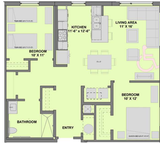
3 UNIT TYPE 2D - (2BR GROUP 2) 3/8" = 1'-0"