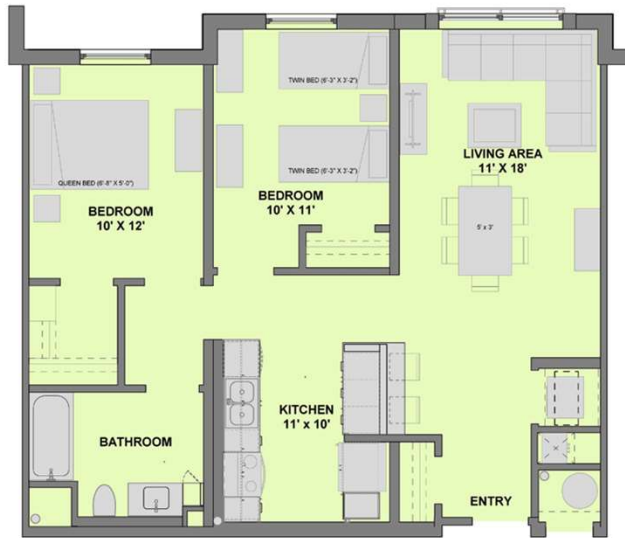
1 UNIT TYPE 2A - (TYPICAL 2BR) 3/8" = 1'-0"