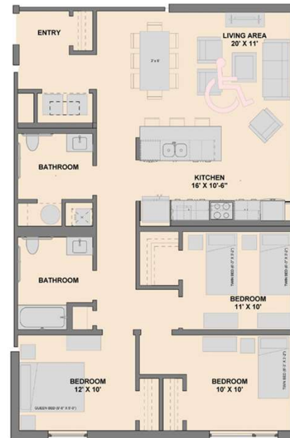
② UNIT TYPE 3A - (TYP. 3BR CORNER-GROUP 1) 38' x 14'