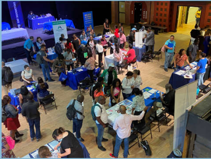
Fall 2024 Career Fair