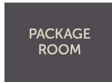
Sign Type 11 Room ID Thermoformed acrylic plaque