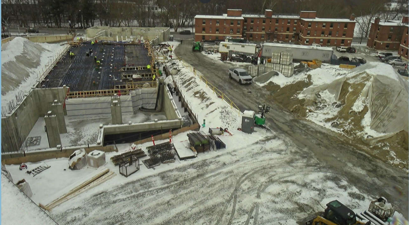
Clarendon Resident Meeting – West Somerville Neighborhood School January 22 nd , 2024