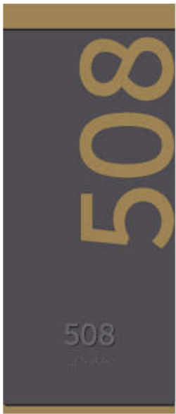
Sign Type 10 Unit ID Thermoformed acrylic plaque with surface printed graphics (scale: 1/4" = 1")