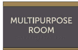
Sign Type 16 Amenity Room ID Thermoformed acrylic plaque with surface printed graphics